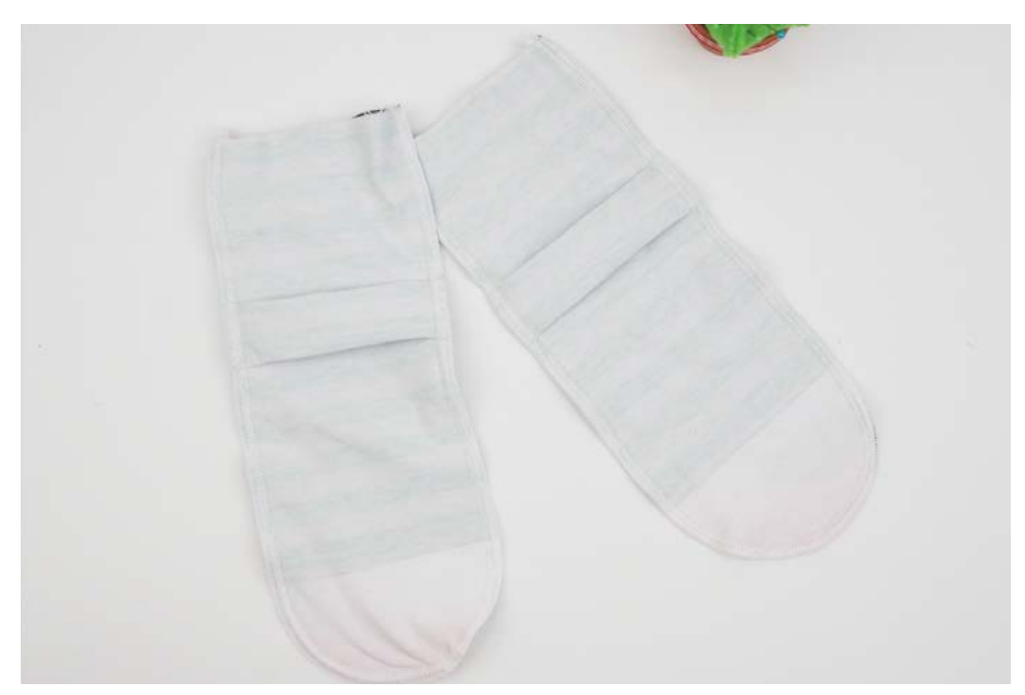
Stitch main sock pieces together using an overedge stitch.