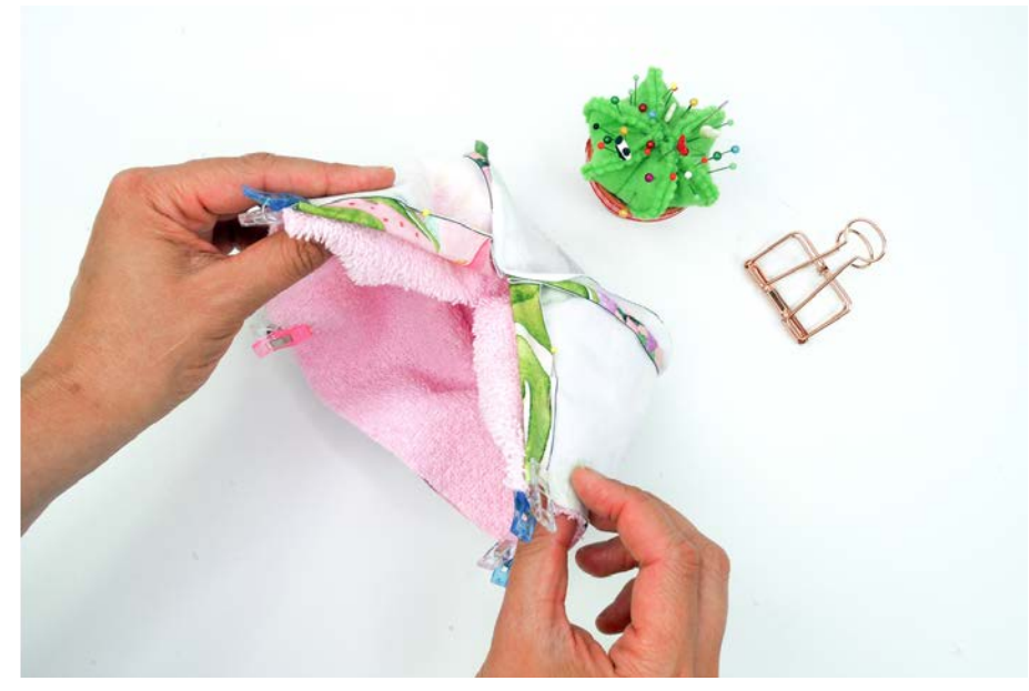
Place the inner bag into the outer, right sides together. Stitch the top edges and trim the seam allowance.