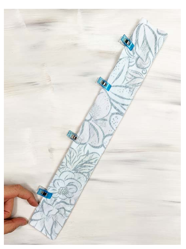
Stitch the rechtangle long edges right sides together. Stop stitching approx. 3 cm from the short edge.