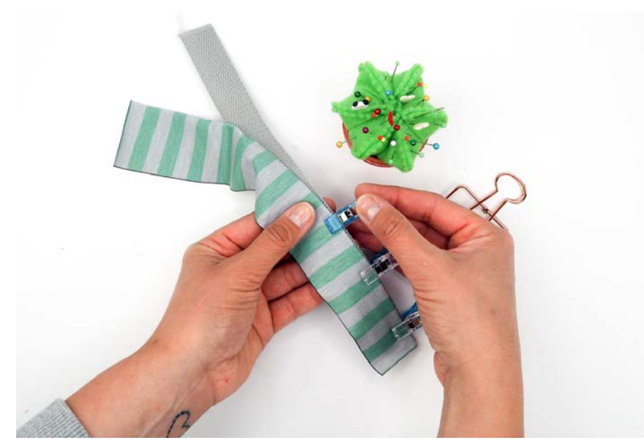
Stitch the bag handle fabric to 2.5 cm-wide webbing. Fold into a loop and pin the ends to one edge of the bag.