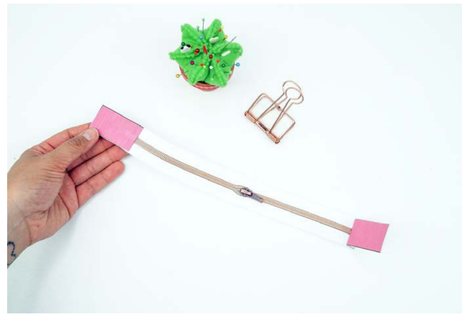
Stitch pieces to ends of zipper, right sides together. Press flat.