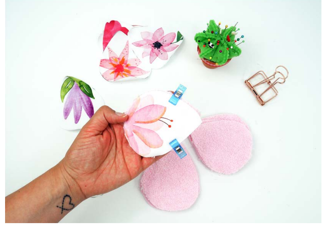
Cut out the pads from the panel. Cut matching pieces from terry cloth or waffel piqué.