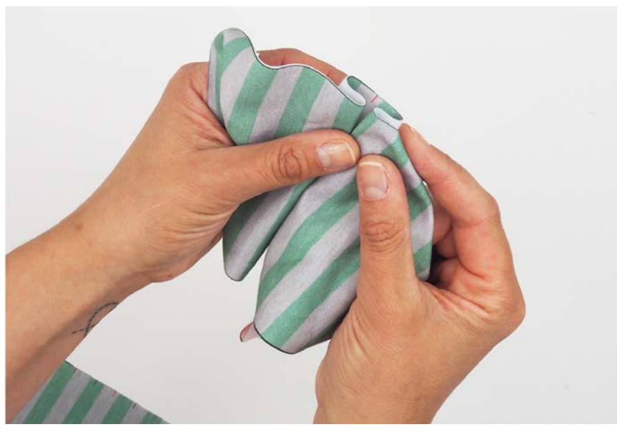
Fold box pleats, match up marks.