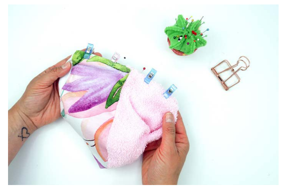
Stitch the open edge right sides together. Leave a small opening for turning in the center of your stitching line.