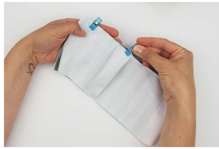
Pin the two main sock pieces right sides together.