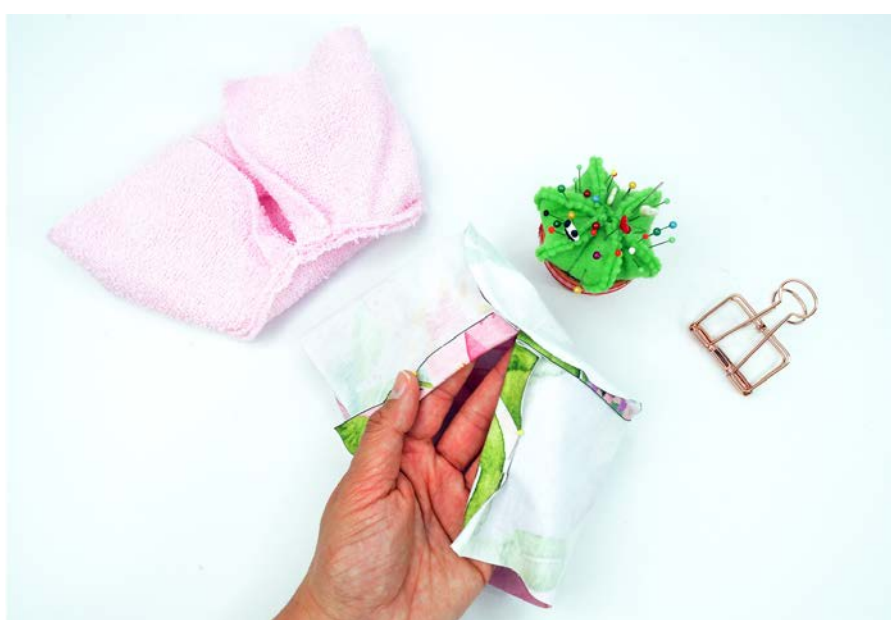
Press the short edges of the rectangle 1.5 toward the fabric wrong side. Stitch the circle to one edge of the rectangle.