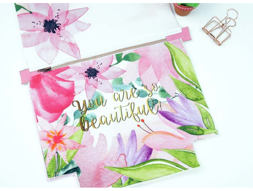
Stitch zipper to upper bag edges, right sides together.