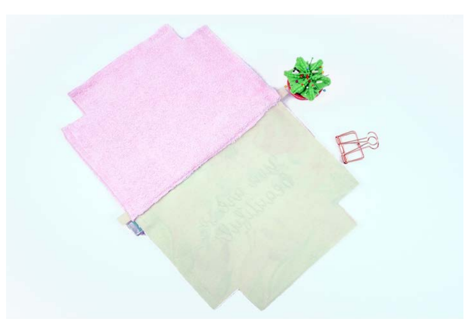
Pin main fabric and lining right sides together and stitch. Leave an opening for turning at the lower edge of the lining.