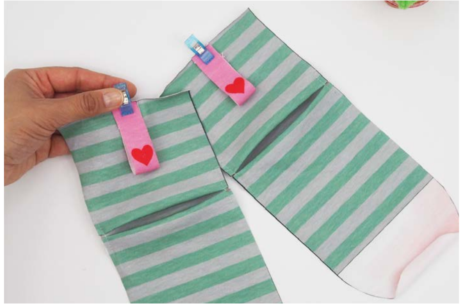
Fold the loops in half and pin to top edge.