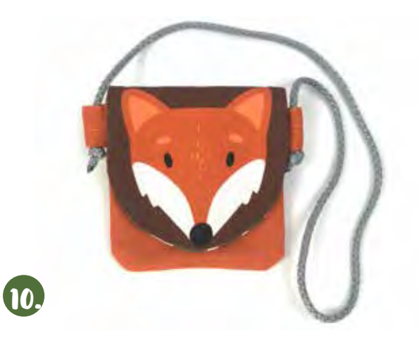
Close the turning opening with a few hand stitches. Thread your braided cord through the loops and knot the ends.